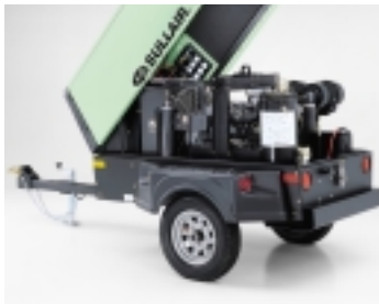
Clam Shell Canopy Compact/Lightweight Design.