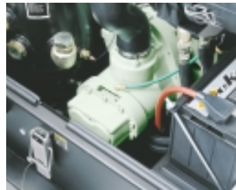
Rotary Screw Design by Sullair. The pioneer in rotary screw technology.