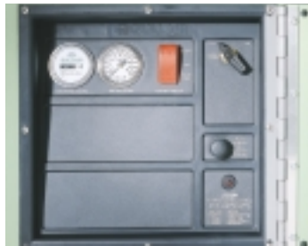
Curbside Instrument Panel With (SSAM) Shutdown System & Annunciation Module